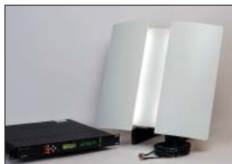
Skylight includes indoor GPS antenna panel, cable, and SecureSync GPS time Server