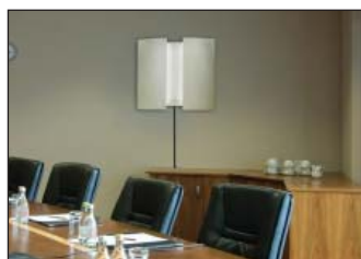
Decorative cover is ideal for use in conference rooms and office spaces

Even though synchronizing network master clocks and time servers to GPS is well-known as the standard for the most time-sensitive applications, some data centers and critical server locations are not conducive to traditional roof-top GPS antenna installation. SkyLight™ provides a solution. Consisting of an indoor GPS antenna panel, a configuration of Spectracom’s SecureSync® modular GPS time server, and an interconnect cable, SkyLight opens new possibilities for accurate GPS time.